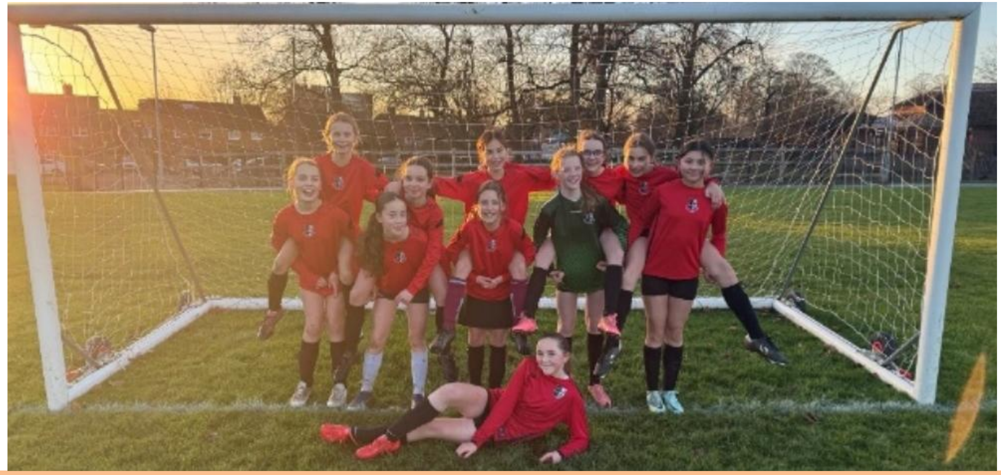
The UI2 girls' football team secured a place in the Leeds Cup semi-final after a 2-1 win against Allerton Grange. The team were dominant throughout the game showing great potential. Well done team!