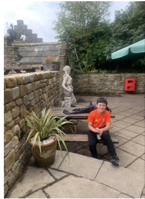
Y7 Forbidden Corner