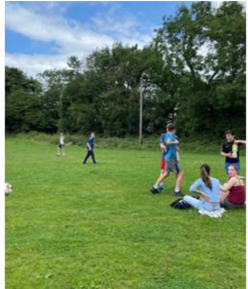
Y7 Walk the Wharfe