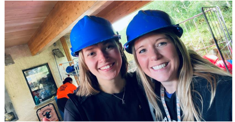
Y9 Caves & Ingleton Waterfall