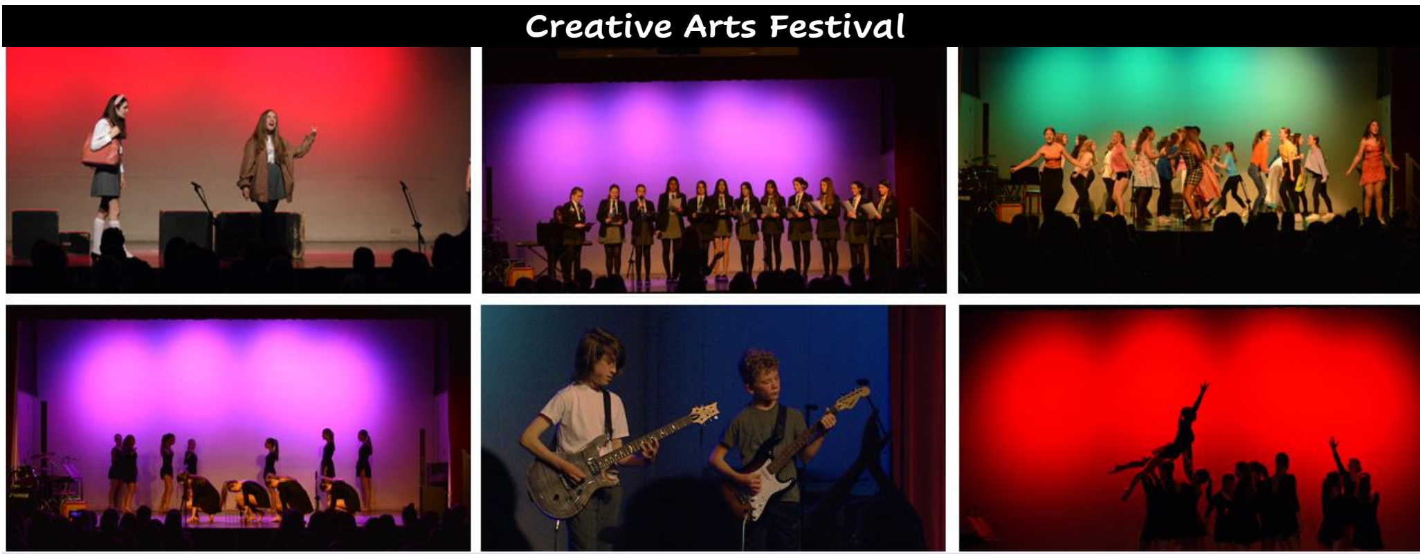
This year's Creative Arts Festival was another wonderful celebration of students' creative work across a range of different departments. This year, we had 236 individual performers over the two evenings, and a large student-led Backstage and Front of House teams in addition to the 178 students who had their work exhibited during the event.

The first night started with the Year 9 Drama group performing extracts from 'Sparkleshark', followed by a 'gig style' concert by our IGS bands who are currently preparing for the IGS Battle of the Bands heats in September and IGS Showcase at the Kings Hall on 6th November, where one band will be selected to go through to the Red Kite Battle of the Bands in January.