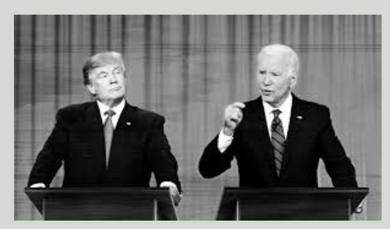
TITLE: BIDEN VS THE POLLS

The American economy is thriving by international standards, whilst inflation may remain higher than the FED stated target of 2%, average wages still linger below pre-pandemic levels, and America holds the title of one of the most economically unequal countries in the developed world. It is still performing much better than its peer's economies: inflation has stayed relatively low and come down faster than in Europe. Unemployment is just shy of hitting a five-decade low, at 3.7%, and GDP grew at an annualised rate of 5% in the third quarter of last year. Trump spent much of his time at POTUS obsessed with the SNP 500, which just hit a record high under Biden.